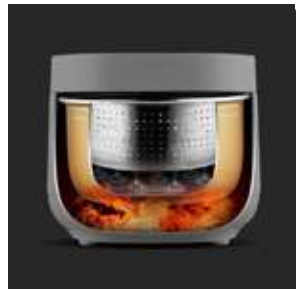
Step 1:Dissolution of Starch

When the water boils, the starch sinks into the bottom of the pot along with the rice soup and separates from the rice.