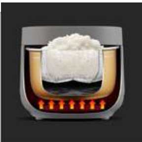
Step 3:Steam Rice

The starch is filtered through hundreds of filter holes into the mother bladder, taking away a large amount of starch.