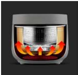
Step 2:Draining Sugar

When the water boils, the starch sinks into the bottom of the pot along with the rice soup and separates from the rice.